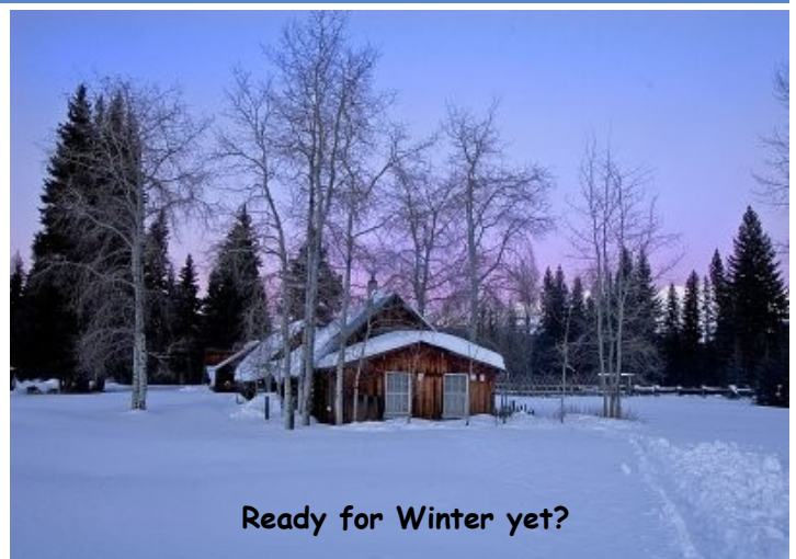
Ready for Winter yet?

Fire was discovered near Ninko Creek on Friday, September 18 burning to the west of the 2003 Wedge Canyon Fire and north of Whale Creek .