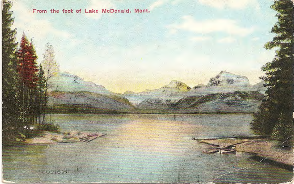
From the foot of Lake McDonald, Mont.